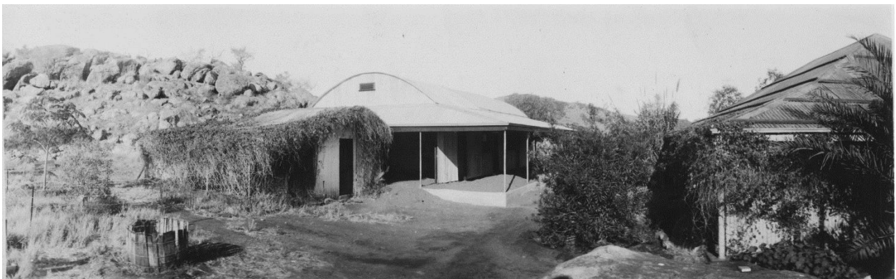
Shearers quarters, Karratha Station, 1930s Courtesy Shire of Roebourne Local History Office, 2005.723