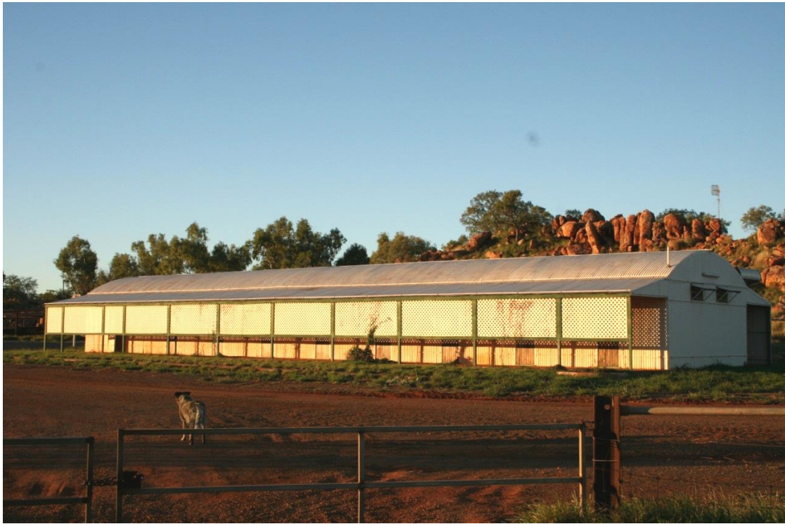
Workers' quarters at Karratha Station, 2012