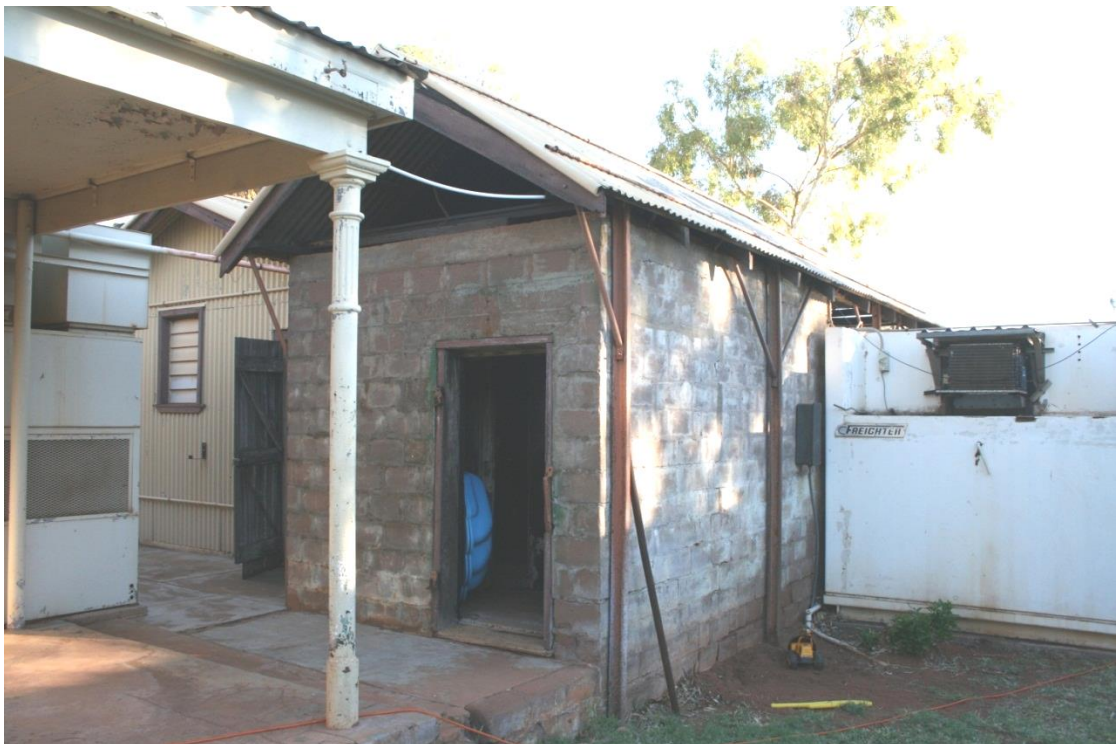
Saltroom at Karratha Station, 2012