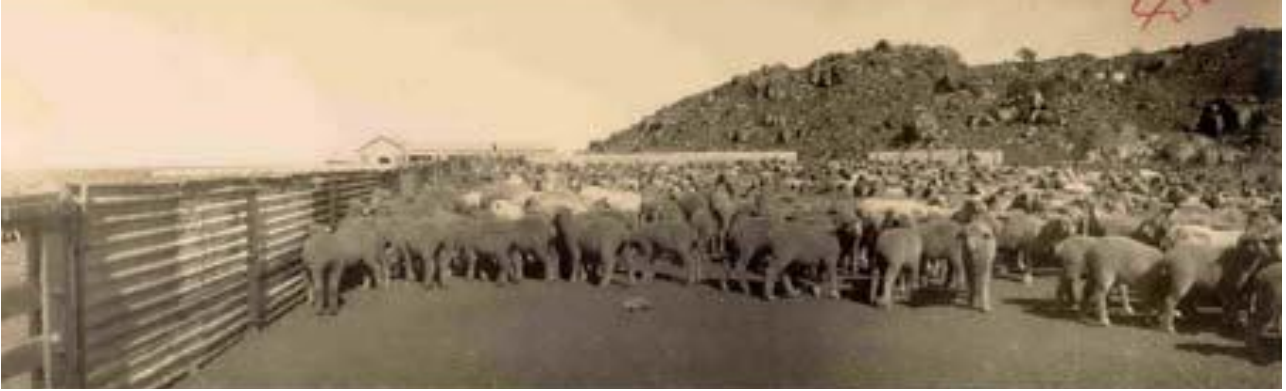
Sheep in the shearing pens on Karratha station, 1933 Courtesy Shire of Roebourne Local History Office, 2005.727