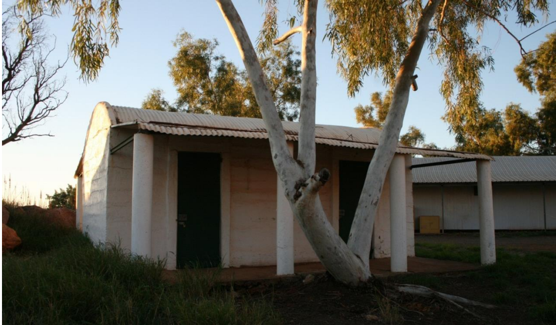
Residence (Plan: Building number 14) 2012