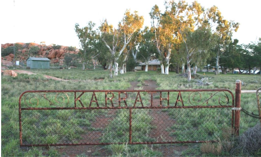
Karratha Station gates 2012