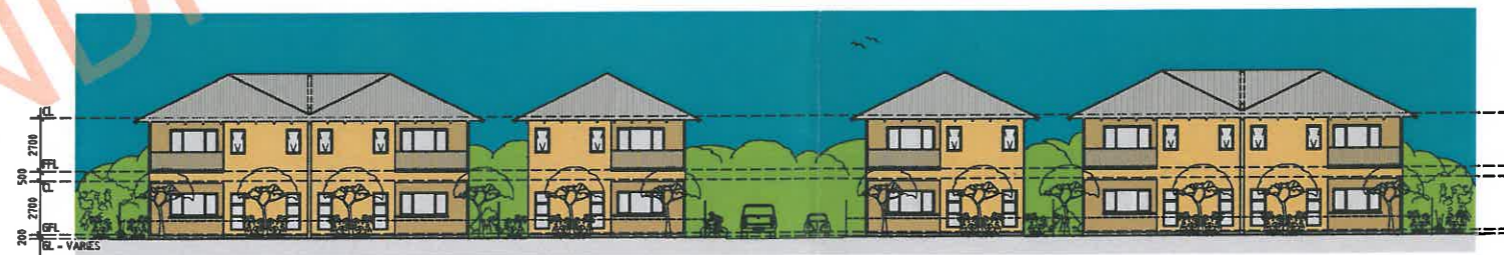
PROPOSED RIDLEY STREET ELEVATION